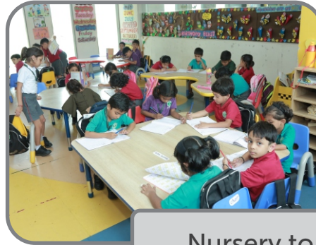
Nursery to KG II

Our campus unites approximately 1600+ students served by 99+ faculty and staff, creating a diverse and inclusive community.