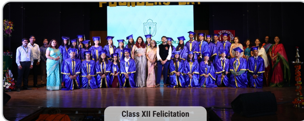
Class XII Felicitation