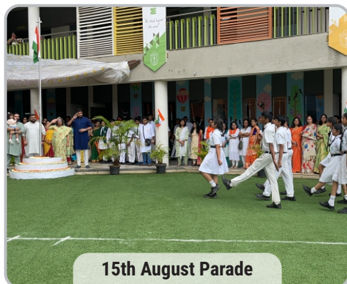
15th August Parade