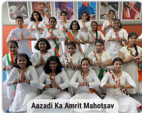
Aazadi Ka Amrit Mahotsav