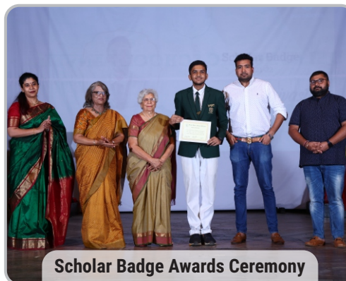
Scholar Badge Awards Ceremony