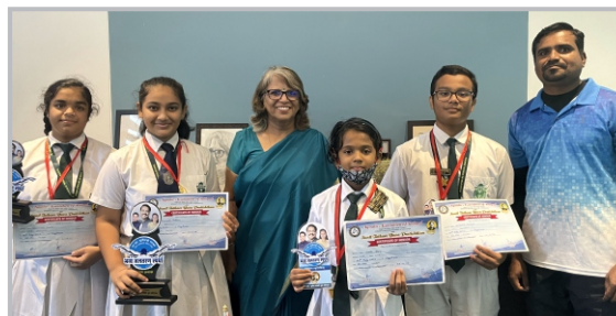
Winners of the district level, Natural pond, open water competition