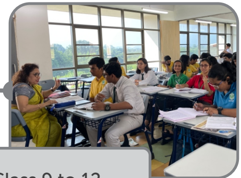
Class 9 to 12