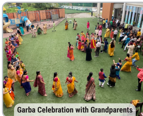
Garba Celebration with Grandparents