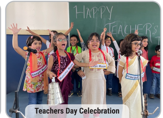
Teachers Day Celebration