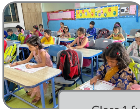
Class 1 & 2