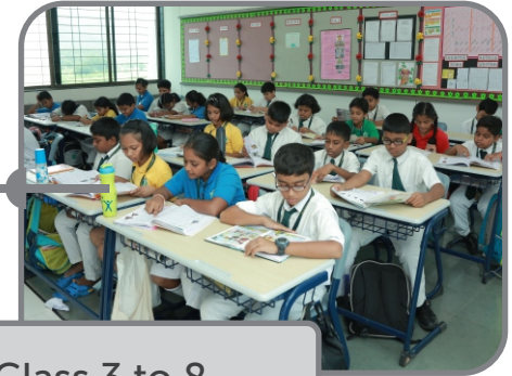
Class 3 to 8